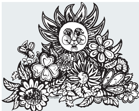
Original Leeper Park Art Fair poster artwork by Jack Appleton.

We're looking ahead to celebrating the 50th anniversary of the Leeper Park Art Fair!