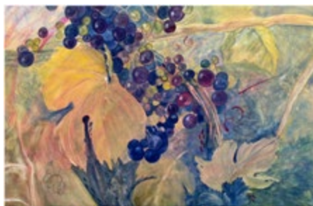
Grape Fantasy Watercolor on Aquabond, 35 X 24

Leota Bauman, Symphony of Color http://www.leebauman.com/